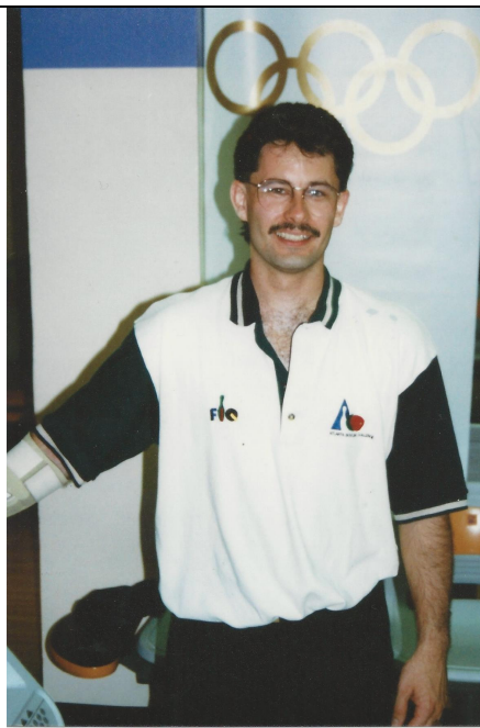
1996 Bill Rowe -- Olympic Games