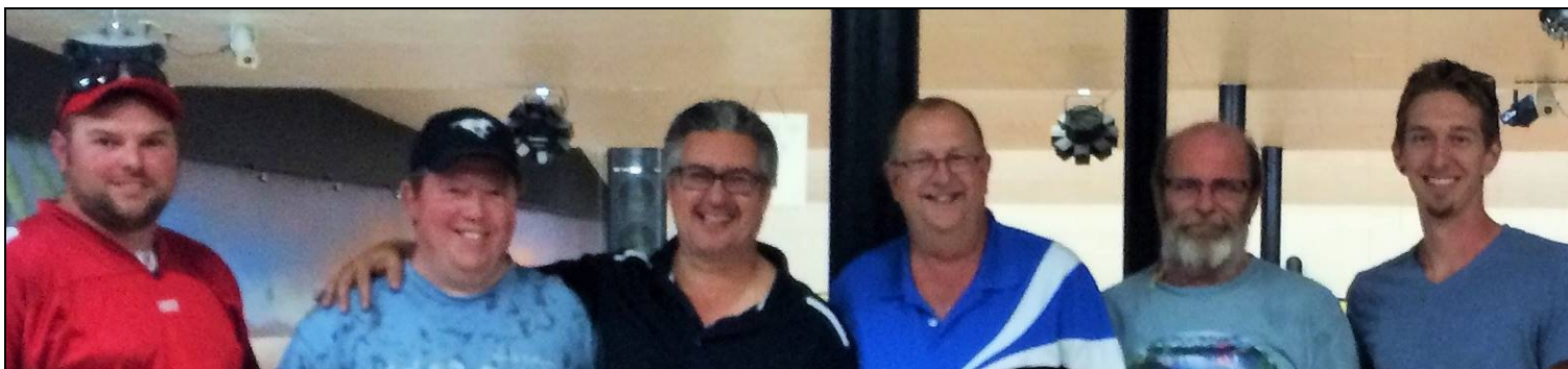
Century Bowl & Mountainview Bowl Crew