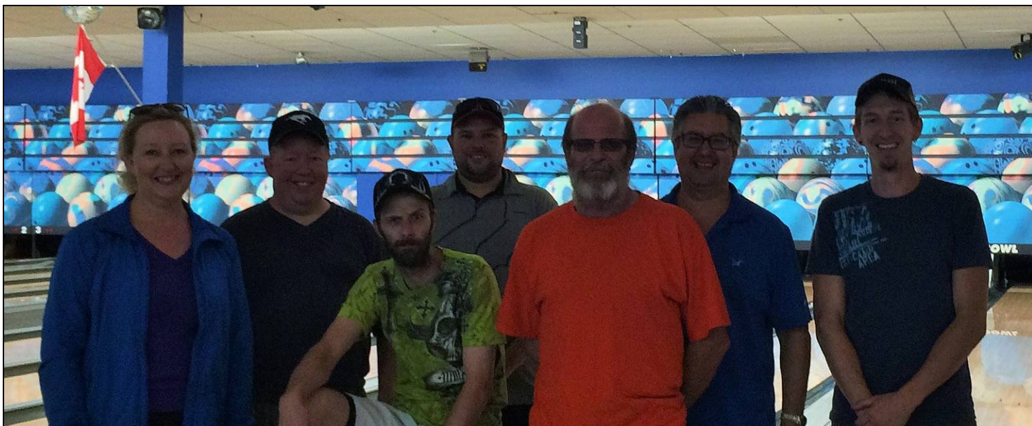
Let's Bowl Crew